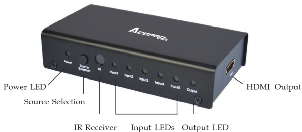
Figure 1: Front side