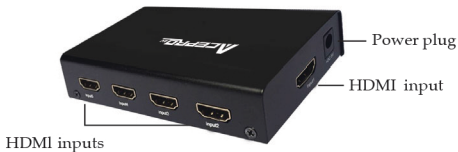
Figure 2: Rear side