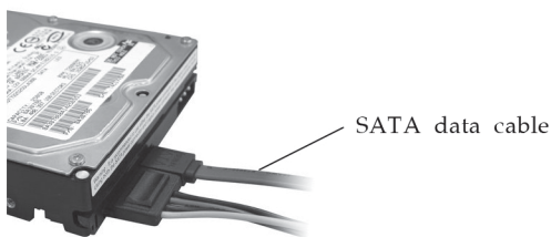
Figure 2. Hard disk drive connections