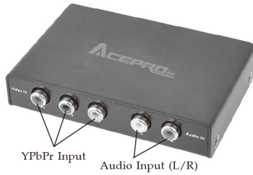
Figure 1: Front view