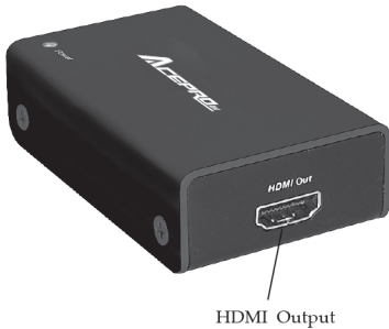
Figure 2: Rear Panel Layout